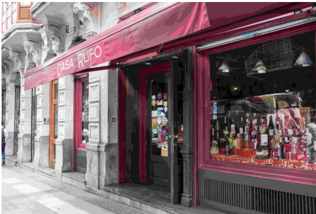
CASA RUFO (C/ Hurtado de Amezaga, 5)

Speciality: T-bone steak and sweetbreads Provençal style.