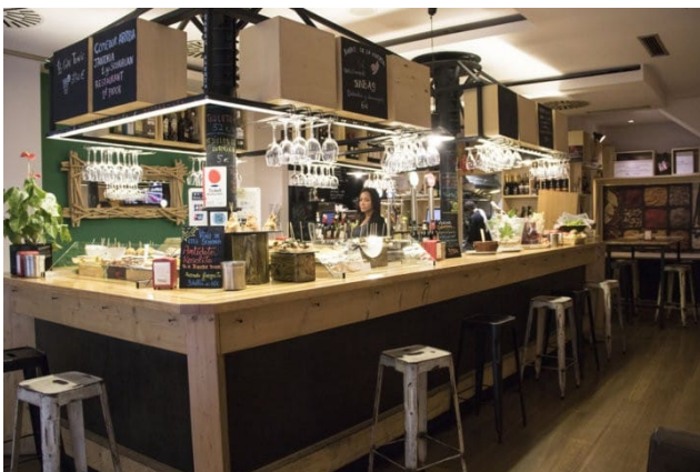
LURRINA (C/ Barrenkale Barrena, 16)

Speciality: Grilled prawns, the authentic ambassadors of this restaurant.