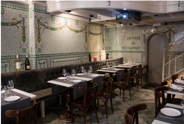
LOS FUEROS (C/ Los Fuegos, 6)

Speciality: Gourmet cod loin, baby squid with their own ink foam, sirloin steak from Galician blonde cows... and of course the pintxo bar which won three eguzkilores in 2022.