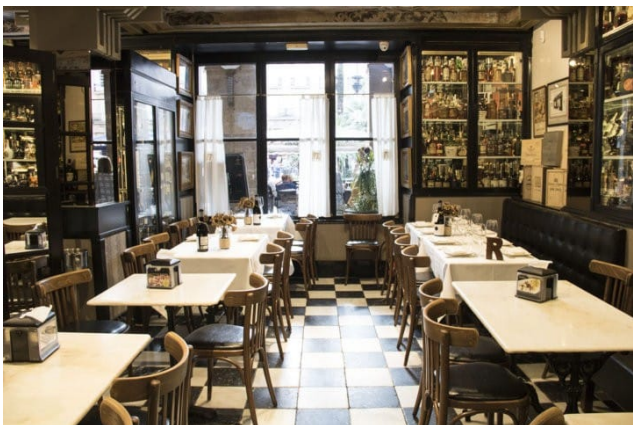
VICTOR MONTES (Plaza Nueva, 8)

Speciality: Cod in all its variations, especially Víctor's style.