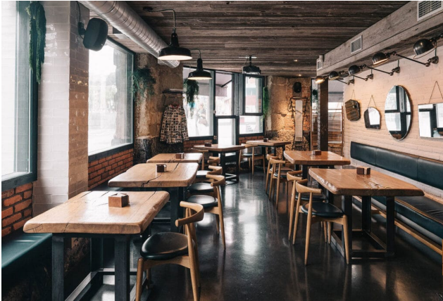
TXOCOOK (C/ Pio Baroja, 5)

Speciality: Spider crab Donosti-style, suckling pig roasted at a low-temperature, queen scallops with a Bilbao-style emulsion and fresh fish.