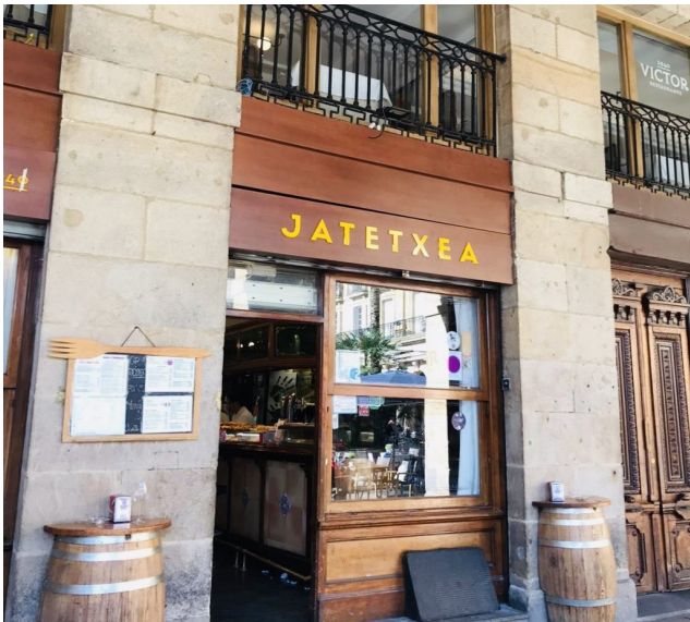
VÍCTOR (Plaza Nueva, 2)

Cod is one of the most emblematic dishes of traditional Basque cuisine, and even more so in Bilbao. If you want to eat a good piece of cod, you won't be disappointed at the Víctor - it's been their speciality since 1940. You can enjoy it prepared in all sorts of ways: pil-pil, Biscay-style and Victor's own style, a recipe created in their kitchens and now found in the most prestigious cookery books. The menu also includes all the specialities of Basque cuisine in the form of meat, fish and seasonal vegetables. Víctor is a reference point for good food in Bilbao.