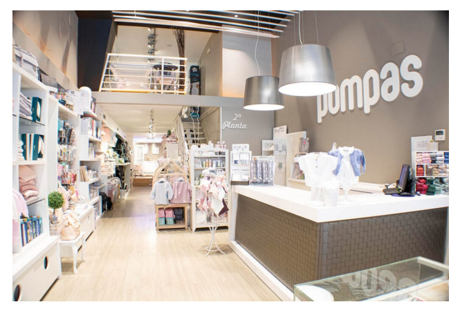
POMPAS: A UNIVERSE FOR THE LITTLE ONES

Deve Moda Infantil is the meeting point between classic and modern. With over 25 years of experience, this shop dresses the youngest members of the household, from newborns to 12-year-old boys and girls (up to size 18) with prestigious brands such as Amaya Fashion for Kids, Carmy Atelier, Lapeppa, Granlei, Marla, Marta y Paula, etc. They specialise in communions and ceremonies with very extensive collections and proposals for all tastes, covering styles ranging from classic to more modern and urban lines. Here you will find quality, elegance and personalised advice so that every child looks impeccable in their most special moments.